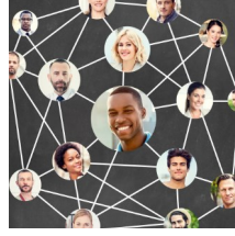
3.0 Improve Community Outreach and Communication